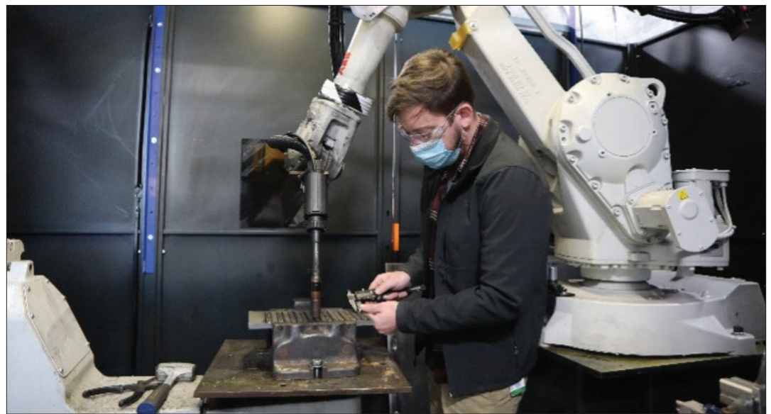
Solvus Global in Leominster.