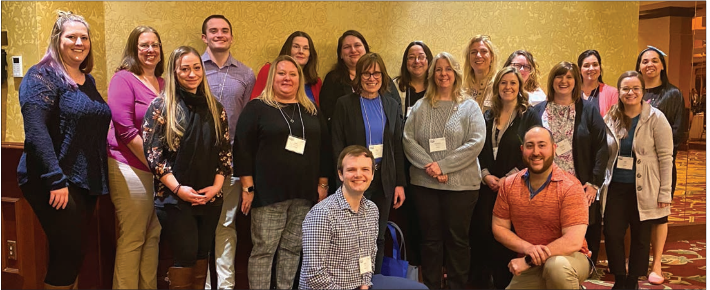
ASNCM EANE Conference.

Established in 1974, The Aging Services of North Central Massachusetts (ASNCM) has paved new opportunities for the older adult community through passion, heart, and a collective hive mind to provide new and improved support services to older adults.