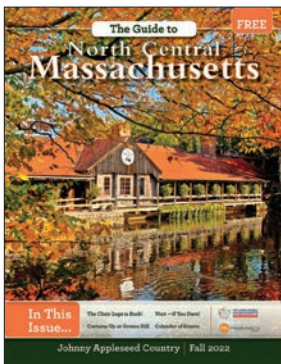
Fall edition of the Guide to North Central Massachusetts.

The Spring/Summer edition of the Guide to North Central Massachusetts was published in April. The magazine is the primary travel publication promoting the communities of North Central Massachusetts and includes information on our local communities, a calendar of events, stories about the region and much more. The guide was distributed