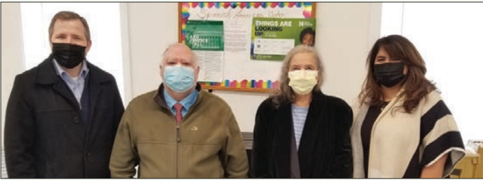
Chamber with with representatives of the Spanish American Center.