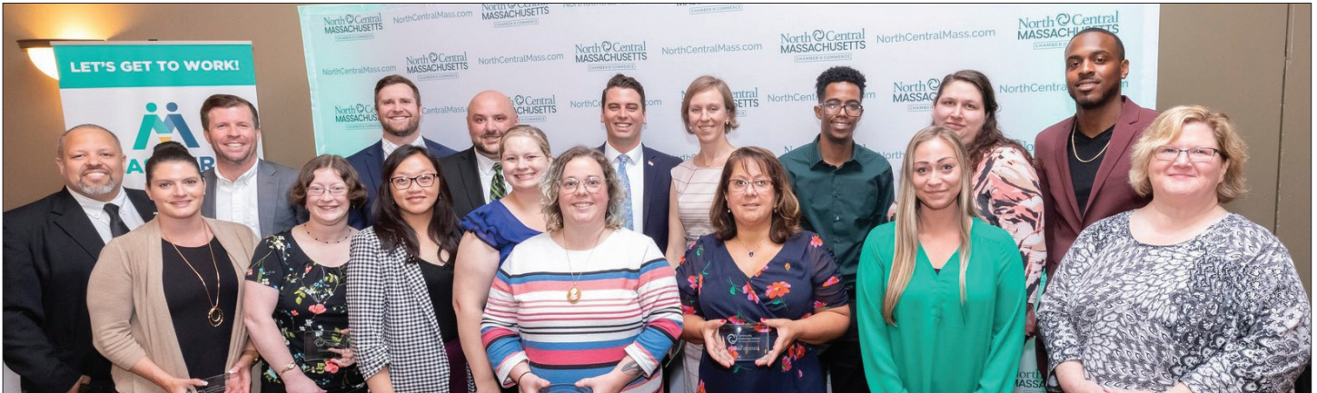
Pictured is the Community Leadership Institute Class of 2022 at the graduation ceremony held during the Chamber's Annual Business Meeting in June.