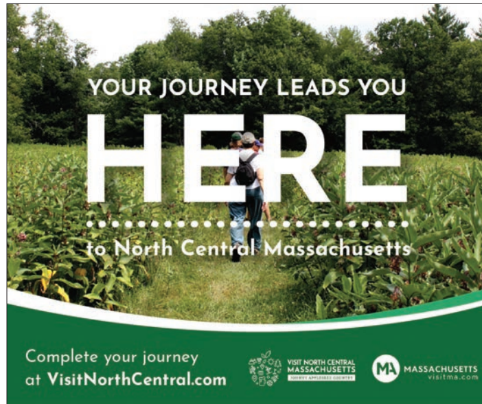
Pictured here is one of the digital banner ads that ran as part of a geotargeted campaign during the Summer.

through AAA offices throughout New England and through CTM Media Group to hundreds of locations including hotels, visitor centers, attractions and airports, including Logan and Worcester. The magazine was also posted on our website. The Fall/Winter edition is now out and you can find it at the visitor center, online and at numerous locations. Members interested in advertising in the 2023 Spring/Summer edition should contact the Chamber to reserve an ad in this popular publication. We also