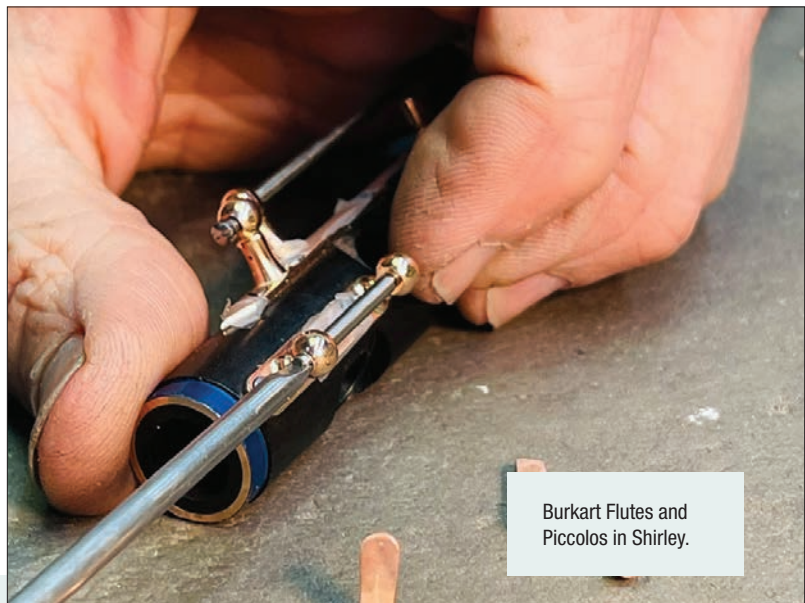
Burkart Flutes and Piccolos in Shirley.