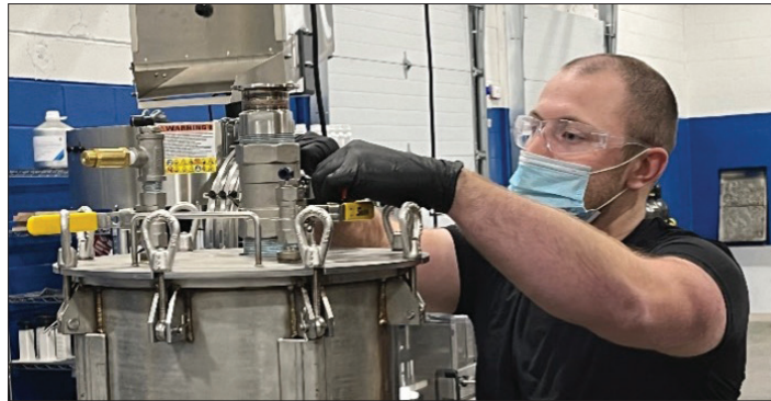
Solvus Global in Leominster.

training program to improve and support the manufacturing industry in the region. "We want to bring the region back to its industrial roots," added Kelly. "We foresee the nucleus of additive manufacturing forming right here in New England. The truth is manufacturing overall is becoming increasingly important to local economies because it offers a lot of growth potential to the region's workforce and that will cultivate a surge in job creation and economic turnaround."